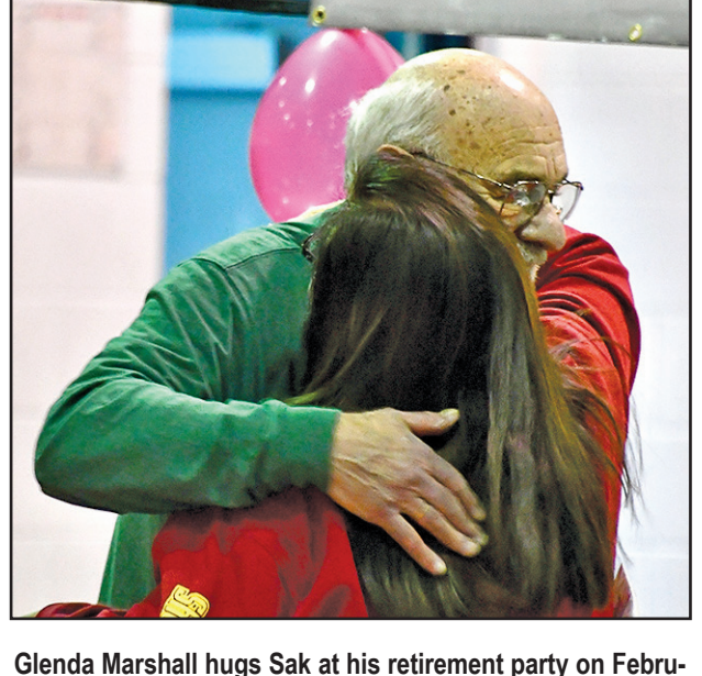
ary 2.